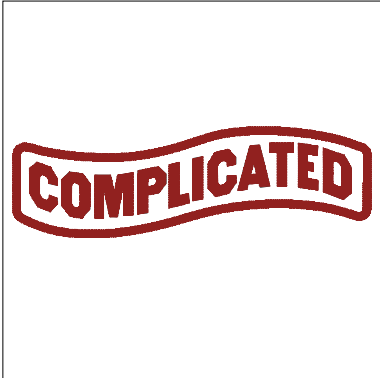
Stop #: 3 Element: Code: 1039 Name: Brick Red Chart: Madeira Classic 40 Stitches: 5,509 Thread used: 34.98m