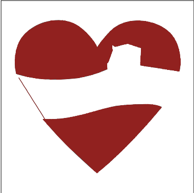
Stop #: 1 Element: Code: 1039 Name: Brick Red Chart: Madeira Classic 40 Stitches: 9,869 Thread used: 66.80m