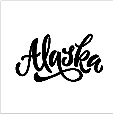
Stop #: 4 Element: Code: 1000 Name: Chart: Madeira Classic 40 Stitches: 4,913 Thread used: 25.31m