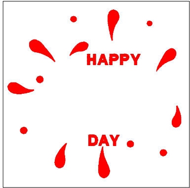
Stop #: 3 Element: Code: 1037 Name: Cinnamon Candy Chart: Madeira Classic 40 Stitches: 2,452 Thread used: 12.53m